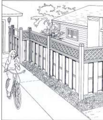
Privacy Fence with Lattice